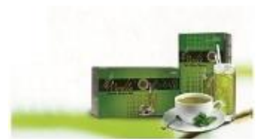
Stevia Green Tea

Demand for tea in Malaysia will continue to grow, as consumers learned more about the healthy facts of drinking tea. There has been noticeable increase, in consumption with the annual intake now at about 29 million kilograms in 2017, against 18 million kilograms in 2007, with the current per capita consumption standing at 910 grams, ranking 14 th in the world.