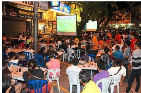
Drinking tea while watch live telecast at Mamak Store

All Malaysians love Teh Tarik (Pulled Tea). The preparation of Teh Tarik has evolved to a “performing art”, with the tea master preparing it along the rhythmic of music, and even to the extent of choreographed stunt for showcasing the tea culture. As such, the Tea Trade Association of Malaysia, a non-government, non-profit business association established in 1956, organised the PIALA TTAM-Battle of Teh Tarik 2014, 2015 and 2018 with the objective to promote Teh Tarik as a