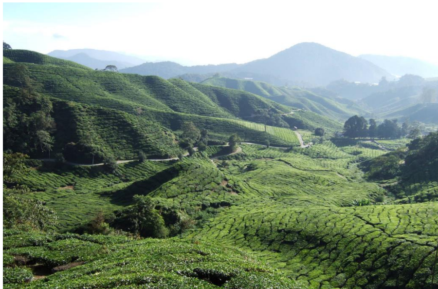
Tea Gardens in Cameron Highlands, Malaysia

Malaysia Tea Market has certainly become prosperous over the decades with tea tourism, tea fairs, tea expo taking place all year round. It is time to consider the advancement in aspects like quality and branding consciousness, and even the trendy market.