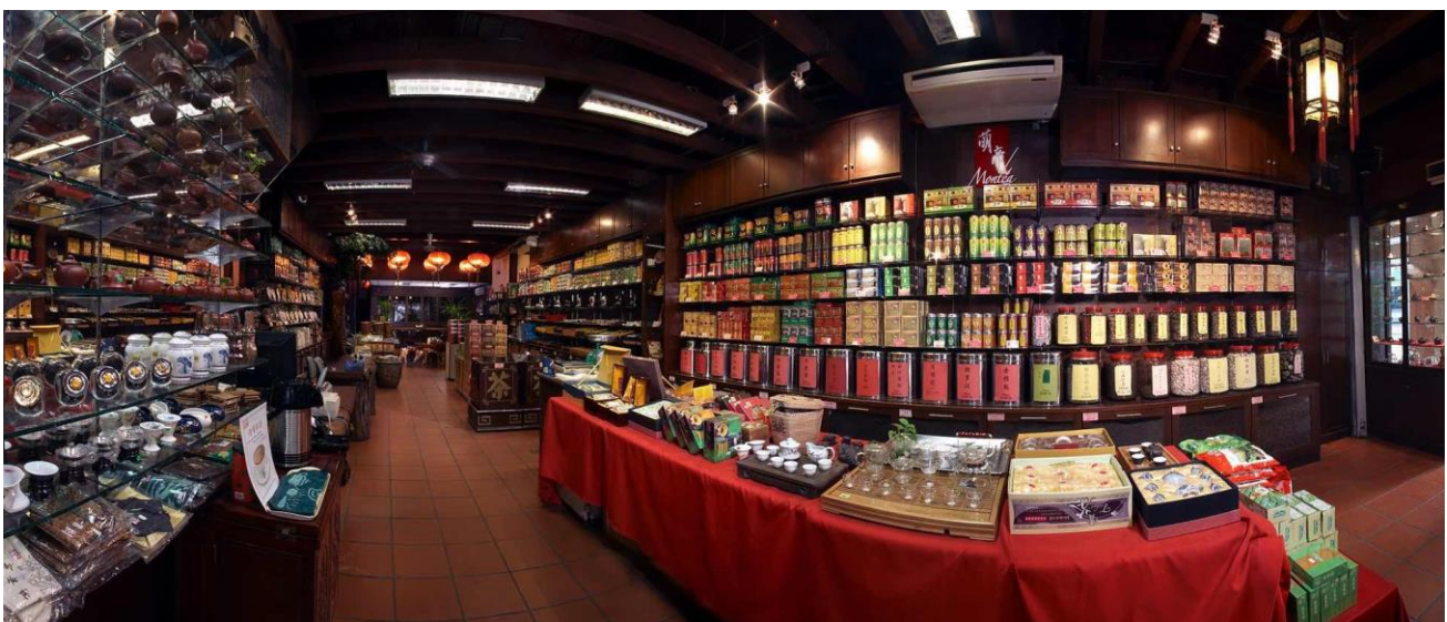
KWF Tea shop in Kuala Lumpur

A few established brands of Japanese teas are readily available in supermarkets, Japanese grocery stores across Malaysia. Sencha, Genmaicha and Matcha are the few popular types. Japanese teas are mostly consumed in Japanese restaurants. There is huge potential to increase the consumption of Japanese teas in Malaysia. Promotion of other types Japanese teas like Gyokuro, Hojicha, Bancha, Iribancha, Kukicha, etc are required. We also see Korean Tea drinking in Malaysia, but it is still niche. New Variants like stevia tea, fruit infusion tea, plant infusion tea, herbal infusion tea is becoming popular in Malaysia with the general acknowledgement of it helps to boost immune system and to reduce cholesterol and blood pressure. In other word, the rising health-consciousness amongst Malaysian consumers is driving them to learn more about the variety of teas and its health benefits, and of course to drink more tea. Ready-To-Drink (RTD) tea consumption recorded double digit growth in recent years in Malaysia, with the green tea based RTD leading the performance. This is also mostly driven by the rising demand for healthy, low sugar beverages of the younger generations and the rising health- consciousness consumer group.