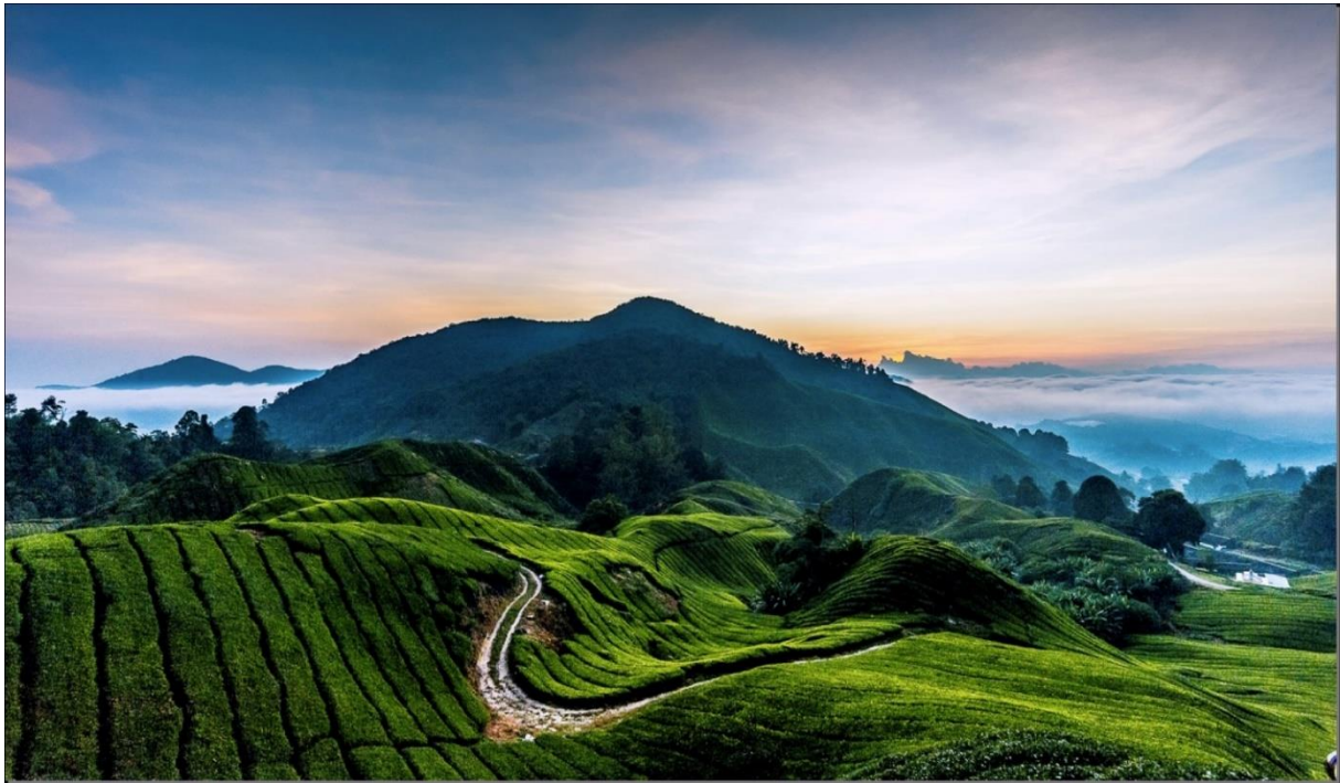
Tea Gardens in Cameron Highlands, Malaysia