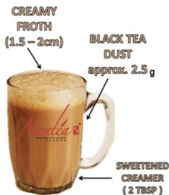
A Typical Glass of Teh Tarik

Malaysia has a deep bond with tea. Anytime is Tea Time in Malaysia. Breakfast, morning tea break, lunch, afternoon tea break, dinner, supper, literally all the time. Tea is available every corner, from the cheapest “mamak” (Indian Muslim) stalls to high end outlets and even 24 hours’ tea stalls throughout Malaysia.