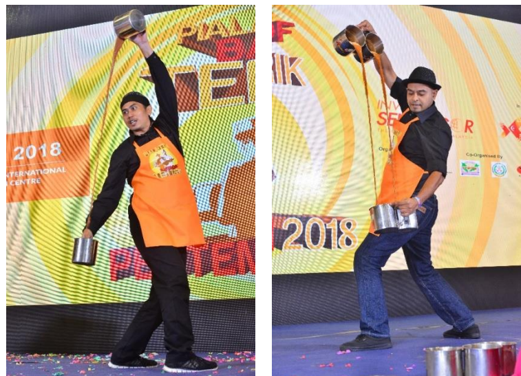
Piala TTAM 2018-Battle of Teh Tarik

All Malaysians love Teh Tarik (Pulled Tea). The preparation of Teh Tarik has evolved to a “performing art”, with the tea master preparing it along the rhythmic of music, and even to the extent of choreographed stunt for showcasing the tea culture. As such, the Tea Trade Association of Malaysia, a non-government, non-profit business association established in 1956, organised the PIALA TTAM-Battle of Teh Tarik 2014, 2015 and 2018 with the objective to promote Teh Tarik as a