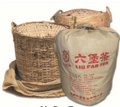
Liu Pao Tea

Out of all the tea varieties, Chinese teas are consumed relatively minimal amongst Malaysian. To announce a 15% of population consuming Chinese Tea could be an overstatement. Nonetheless, the common and popular types of Chinese teas consumed in Malaysia are Jasmine Tea, Pu'er dark tea, Liu Pao dark Tea, Oolong tea (Ti Kuan Yin, Hsui Hsien, etc). As such, there is plenty of room and potential to improve on this and recent developments on Chinese tea in the echo of China's Belt and Road Initiatives over the last few years are encouraging. We see leading tea company in China investing into modern tea houses